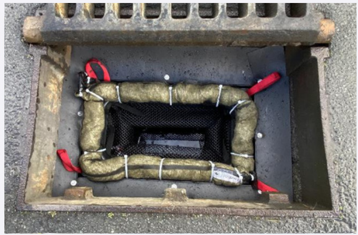
LavaSorb™ Boom set up with EnviroPod™ LittaTrap™ to ensure it absorbs the oils and oil-based liquids.