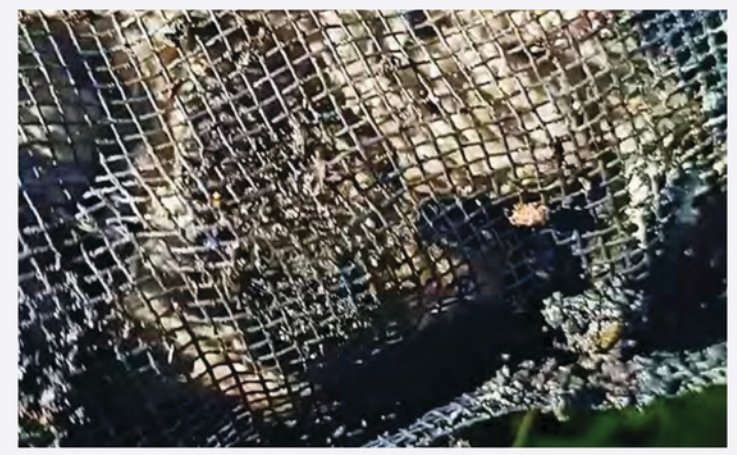
This sock shows dark areas where oils have been absorbed, as well as the light areas that show the basalt fibers can absorb much more.