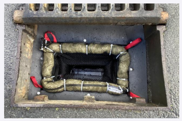
LavaSorb™ Boom set up with EnviroPod™ LittaTrap™ to ensure it absorbs the oils and oil-based liquids.