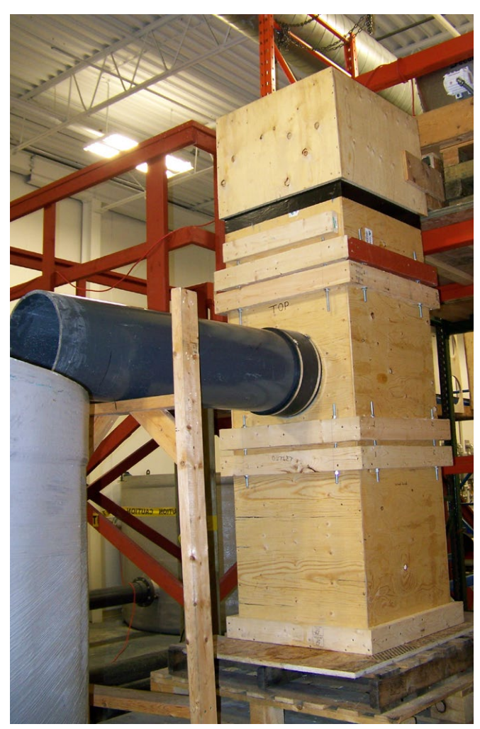
EnviroBasin™ Lab Testing